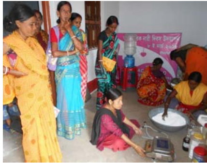
DETERGENT MAKING BY SHG MEMBERS